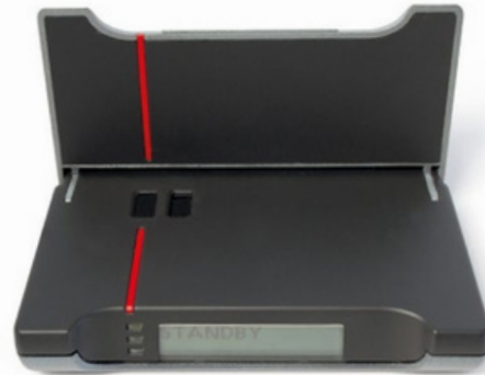
Patron® Hand Held Reader (HHR)

The units emit an IR beam of a specific frequency which excites the taggant sample. This causes an IR response from the taggant sample in a different area of the IR spectrum. The response is detected by the reader and the response signature is converted through complex algorithms into a unique code.