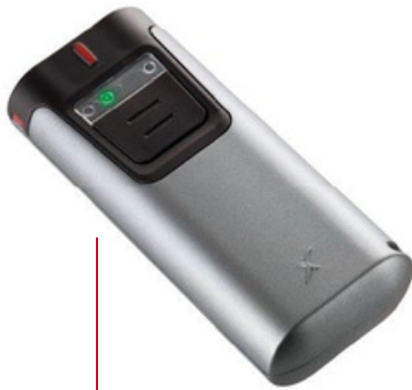
Patron® Taggant Pocket Reader (TPR)

Both are hand held, battery operated units with a patented detection method. An authentication response is provided by the units within two seconds, signalled by LED light and either text response OR vibration dependent on unit.