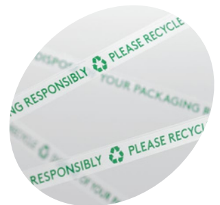
Single ply films, with a water-based adhesive